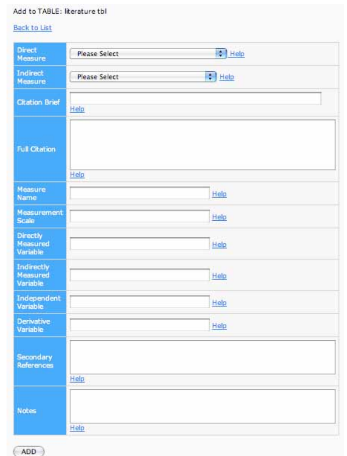
Figure 3. The data entry interface for the literature table. The direct and indirect measure entries will be done through the same pull-down menus as on the search interface (see Fig. 2). If an article contains multiple metrics, each will be entered separately; a ‘copy’ function makes multiple entries easy.