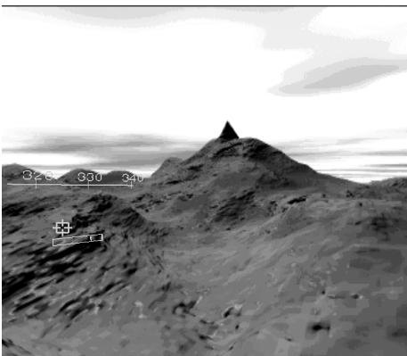
Figure 1. HMD scene. The secondary task and cueing reticle are shown to the left, along with a conformal heading scale that overlays the true horizon.

Figure 1 presents an example of the HMD-depicted scene.