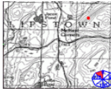
Figure 4. Symbology

Eight military personnel participated in the experiment. The experimental design and target detection tasks were identical to that used in Experiment 1, with the following exceptions: (1) Cueing was available but was presented with only 45° of precision. (2) To better examine the nature of the clutter-scan trade-off, more complex symbology that that used in previous studies was presented on the display. This is shown in Figure 4.